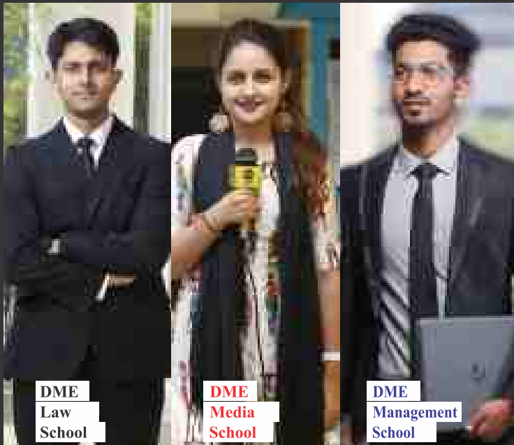
DME Law School