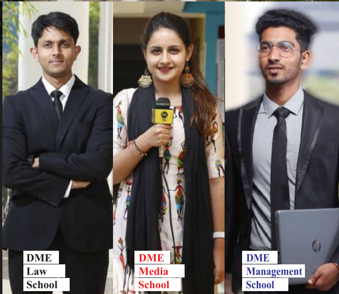
DME Law School