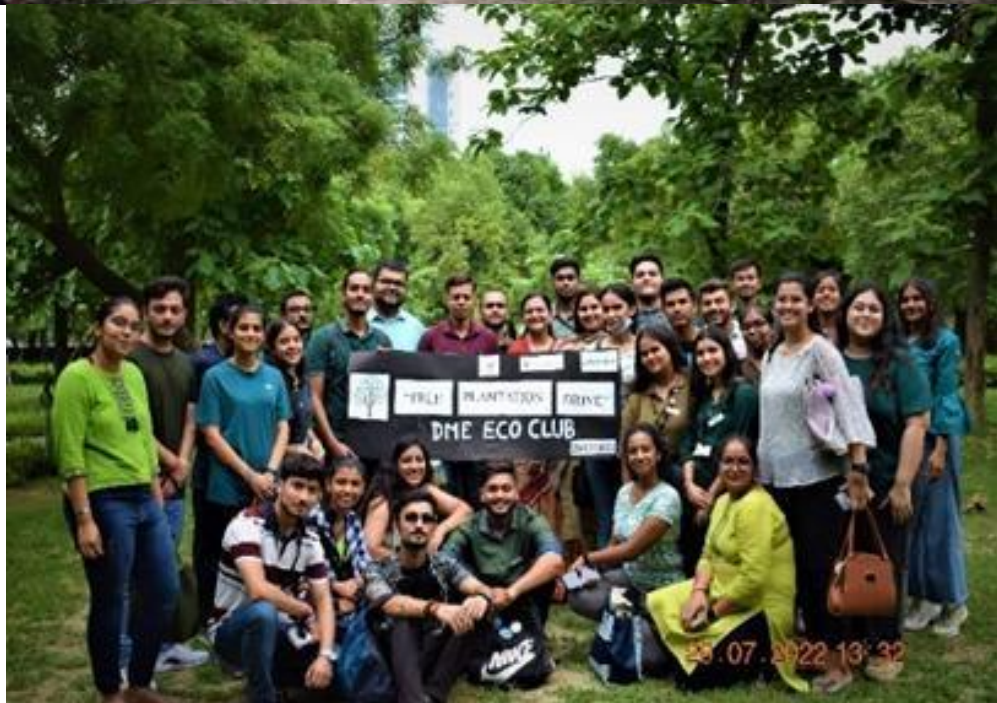
Community Connect Cell and Eco Club members after plantation