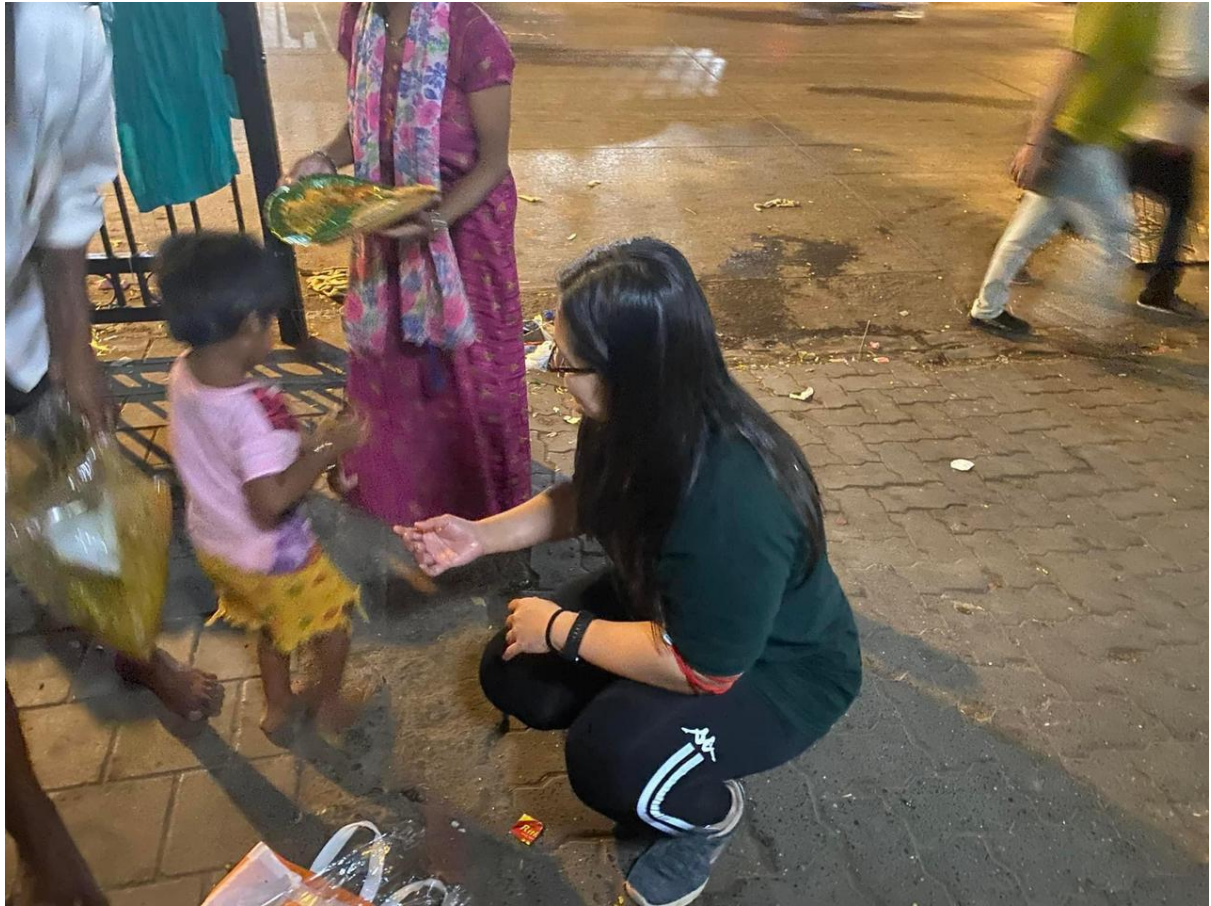
Students playing with children