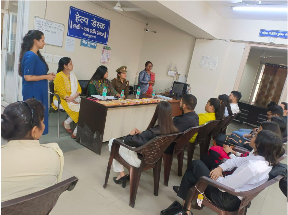
Explaining roles and responsibilities of 'Sakhi Center' in helping women in distress and providing remedies.