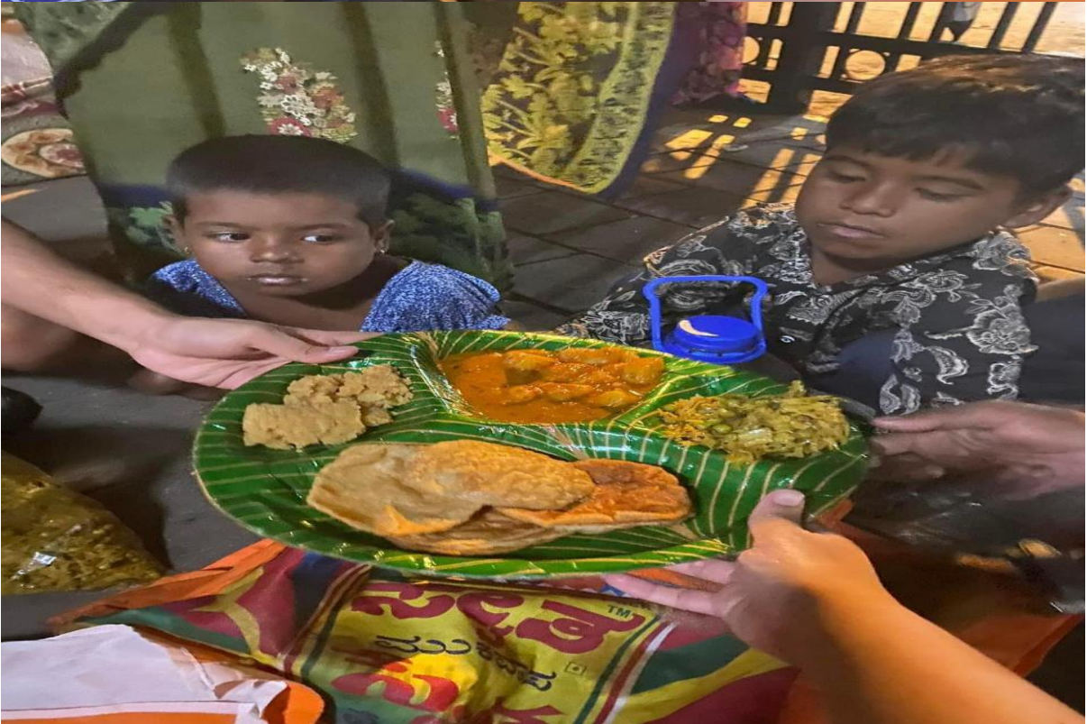
Contributing to the cause that 'no one should go to bed hungry'