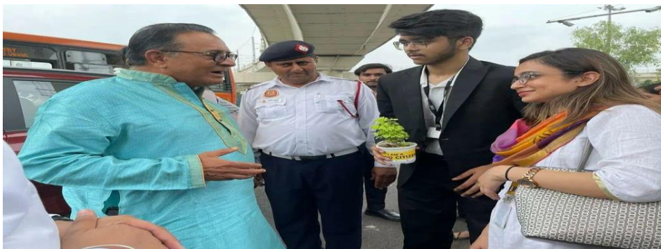
Students and interacting with commuters