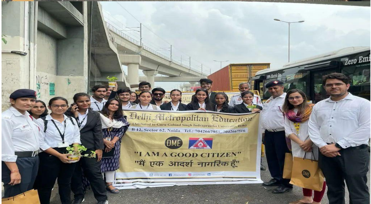
Flag March by Students of DME to spread awareness about traffic rules