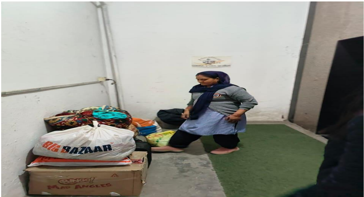
Dropping the Donated Clothes at Goonj Dropping Center

To help poor and disadvantaged people of society in chilling winters, the community connect society organized a donation drive. Students, faculty and staff contributed on a large scale. Unused, leftover warm clothes and stationery items were donated by all for the welfare of people in society. A donation drive was organized from the college campus because of the "International Day of Charity " celebrated annually worldwide. Empty cartons were kept in reception areas, and donations were collected. Lots of donations were received in kind. All the collected donations of clothes were taken on 10th September and given to Goonj, Sarita Vihar, Delhi, NGO, which is working extensively for the welfare of poor and disadvantaged people. Other donations, including stationery items, were further distributed to people and children in community areas.