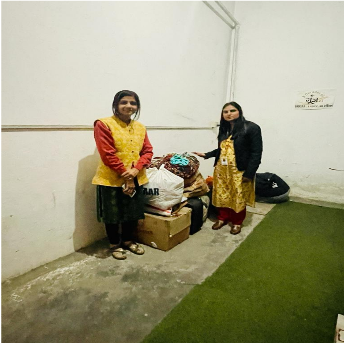
Members of Community Cell at Goonj Dropping Center