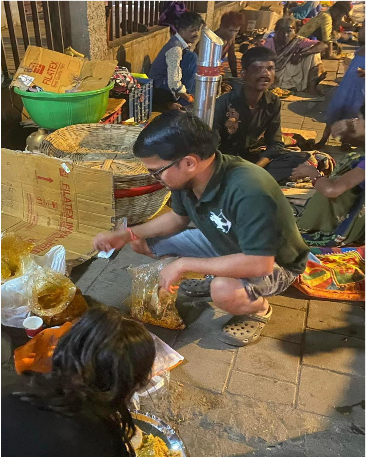
Members of Community Connect and Volnteeres from Robinhood Army Feeding food