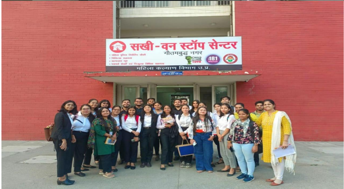
SMembers of Community Connect at Sakhi Center