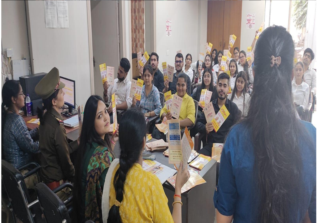
Discussion and sharing the remedies which were available to women like Shakti Mobile, Women Helpdesk etc