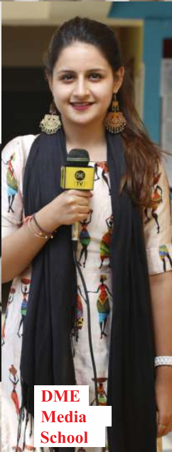
DME Media School