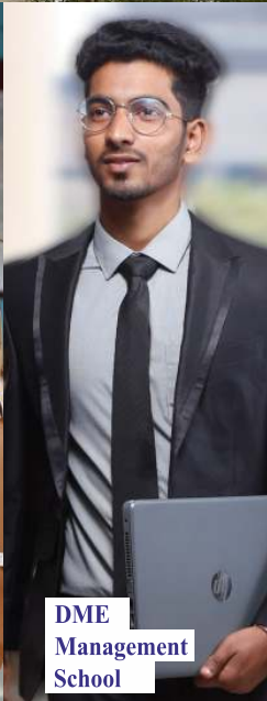
DME Management School

Delhi Metropolitan Education is a premier educational institute affiliated to Guru Gobind Singh Indraprastha University, New Delhi and approved by Bar Council of India. At DME, we provide first rate infrastructure with strong academic facilities to render a dynamic grounding for success.