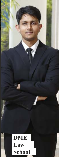
DME Law School