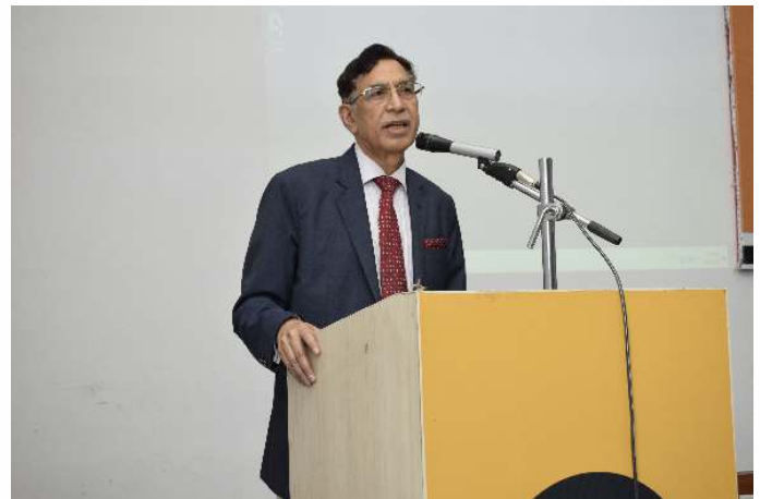
Hon'ble DG Sir addresses the audience