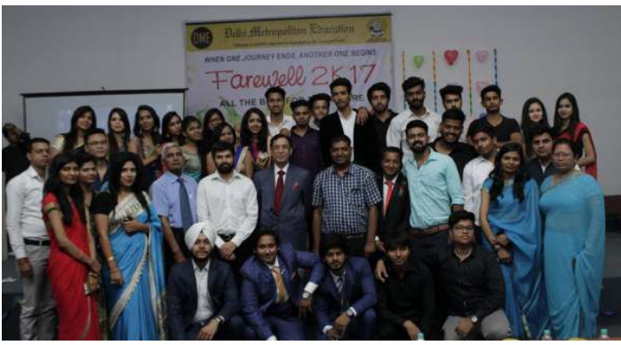
Group photograph @ Farewell 2K17