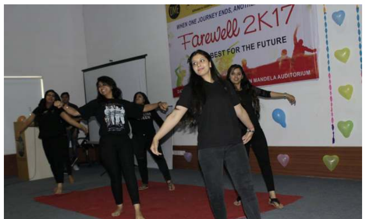
Students Performing @ Farewell 2K17