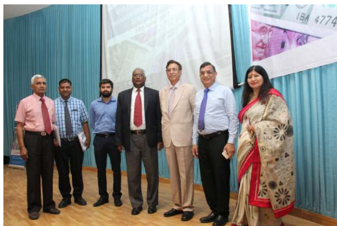
Dignitaries at the Conference