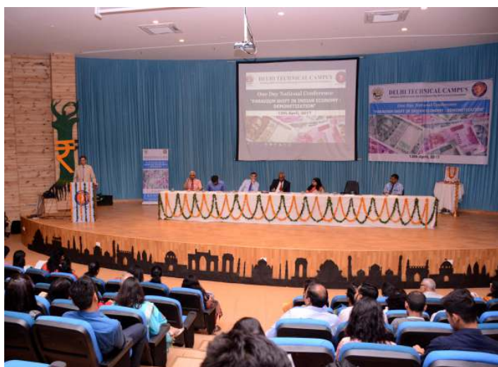
National Conference @ DTC