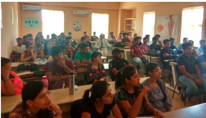
Students attending placement meeting