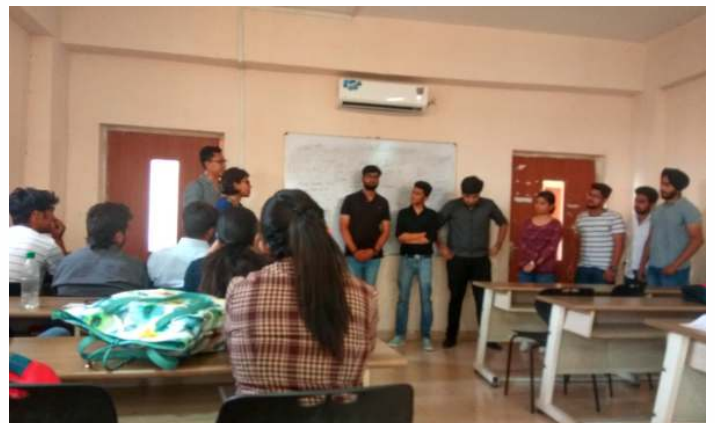
Students participating in grooming session

Both the sessions were attended by both the classes with enthusiasm and they participated in the group discussion and introduction very eagerly. The grooming sessions were found by the students to be helpful and will be taking place in the near future for the other semester students.