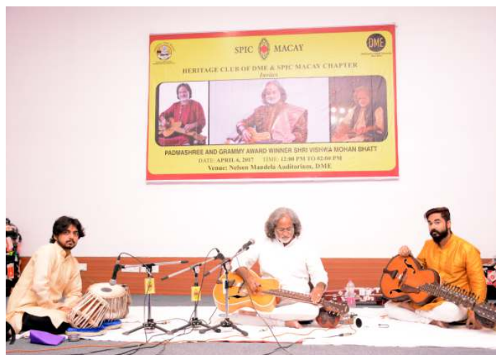
Shri Vishwa Mohan Bhatt spreading the magic

The musician Padma Bhushan and Grammy award winner Shri Vishwa Mohan Bhatt enthralled the audience with his magical performance. The audience was completely spellbound with the sweet sound of “Mohan Veena”. He has always appreciated the change in Indian music as he mentioned once “This is the golden era of music, as people are getting more exposure”. The Nelson Mandela Hall was overflowing with melodious notes of veena in combination with the tabla. All dignitaries sitting in front row along with students behind them, were so engrossed in the musical environment that everyone wished for it to continue forever.