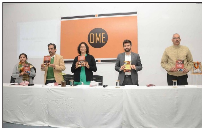
Brochure of CIFFI 2019 unveiled marking the announcement of International film Festival

After the introductory speeches, a documentary made by the students of DME, Media School on the Me Too movement was showcased.