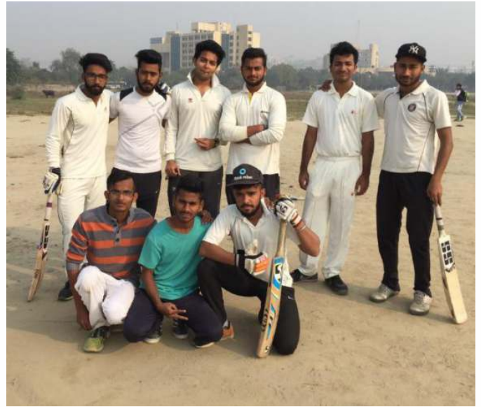
Students posing for photograph in the field

On 22 January, 2017 The students from the department participated in sports event held at GGSIPU campus, Dwarka and won Men cricket league match (1st knock out round) by 18 runs against JIMS, Vasantkunj.