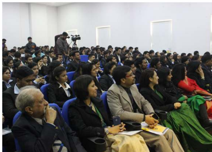
Participants attending the conference