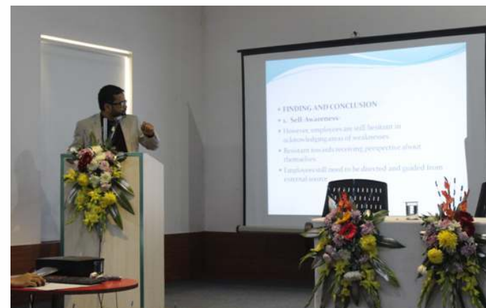
Participant presenting the paper

The quality of the papers presented in the conference were remarkable, outcome of which came in the form of suggestions as a paper on Social Networking Sites effect on Students gave a clear suggestion to academia that they should motivate students to use these facilities for their academic development. And for corporates, papers on Work Life Balance, Employee welfare and Emotional Intelligence gave suggestions on how corporates should manage their manpower effectively.